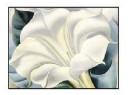
The White Flower (1932) by Georgia O'Keeffe