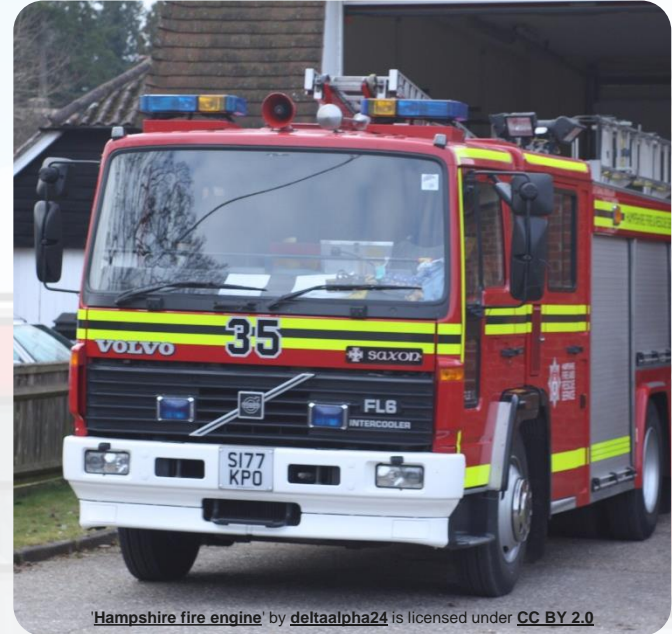
'Hampshire fire engine' by deltaalpha24 is licensed under CC BY 2.0