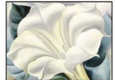
The White Flower (1932) by Georgia O'Keeffe

In Art we are painting, pupils will examine in detail a part of a flower using magnifiers and viewfinders before sketching and then enlarging it. They will develop the techniques of overpainting and wet-on-wet, as well as make tertiary colours. They will respond to the work of artists.