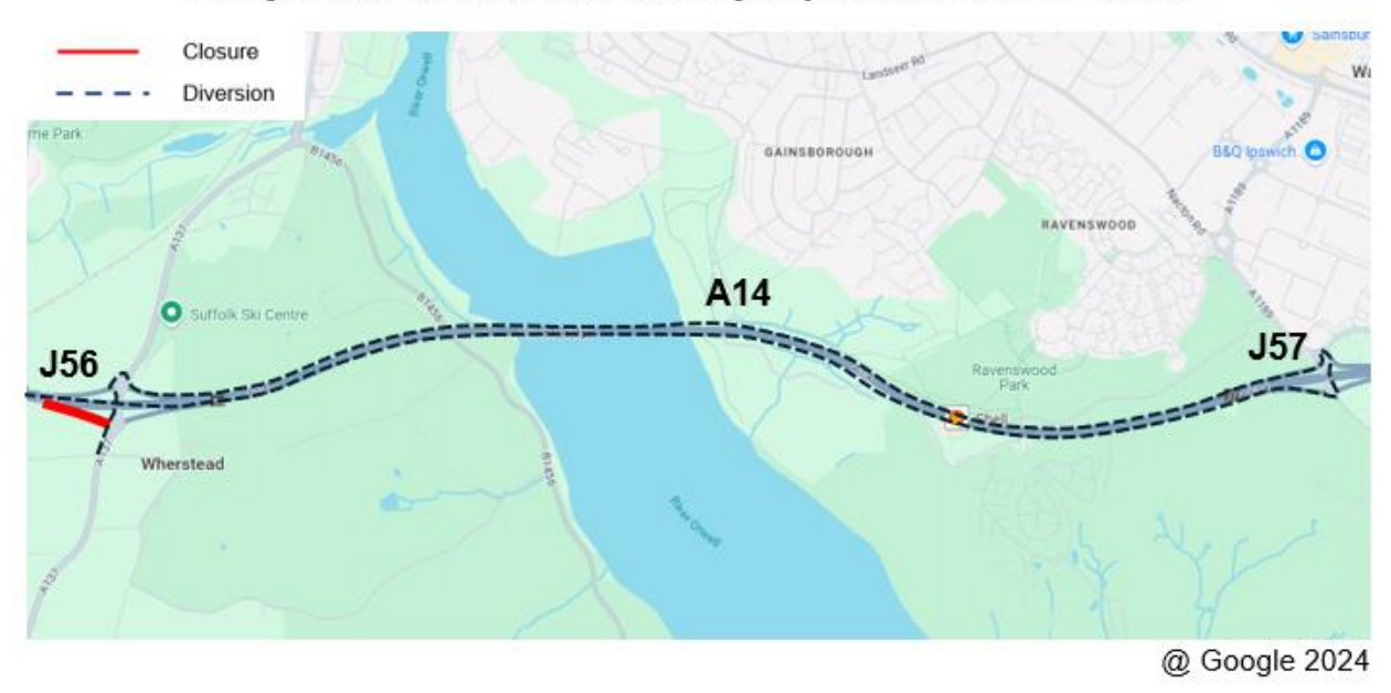
A14 junction 56 westbound entry slip closure and diversion