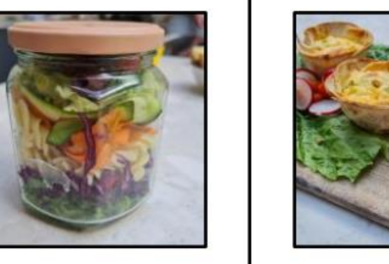
Jam jar salad

In DT we will be learning about what healthy means and learning how to cook healthy food.