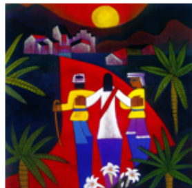
The Road to Emmaus