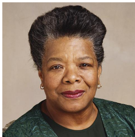
Maya Angelou American singer, dance, actor, writer, poet and activist

“Try to be a rainbow in someone’s cloud.”