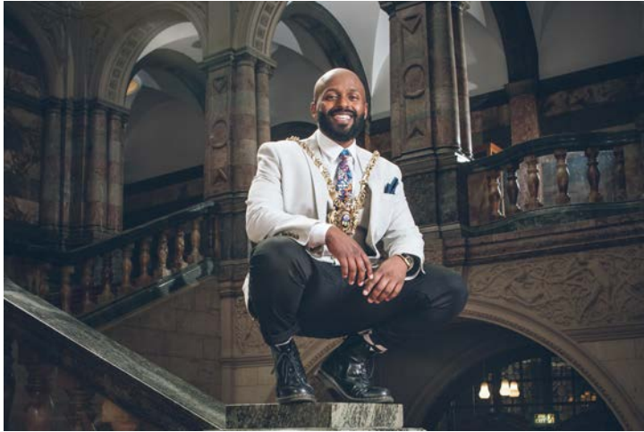
Majid Majid, a refugee from Somalia, elected mayor of Sheffield in 2018