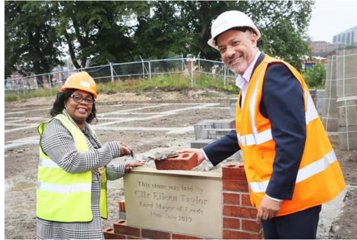
Eileen Taylor, born in Jamaica, elected Lord mayor of Leeds in 2019