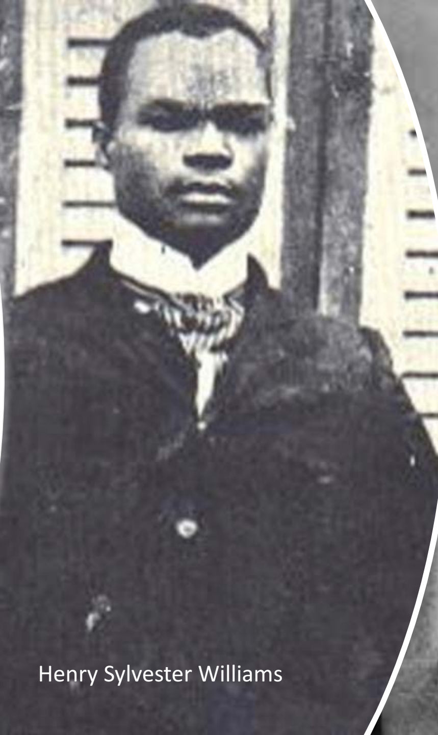
Henry Sylvester Williams