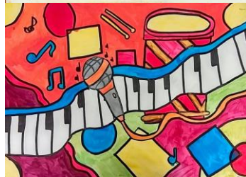
(Kandinsky inspired art)