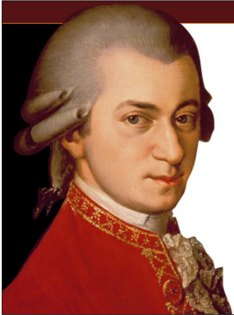
Image of Wolfgang Amadeus Mozart